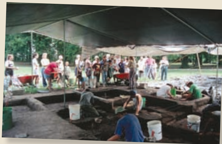
Visitors observe archaeologists excavating at Parkin Archeological State Park.

Despite the generous start-up grants and the acquisition of two world-class archaeological preserves, the little-known Conservancy struggled to develop a national following during its early years. Then former Secretary of the Interior Stewart Udall, a nationally known conservationist, became chairman of the Conservancy's board in 1982, giving the organization greater credibility and bringing in more funds. The Conservancy slowly built its membership, initially offering members a quarterly newsletter, and then in 1997 launching American Archaeology , an award-winning quarterly magazine that focused on news, research, and issues in North American archaeology, as well as the Conservancy's preservation work.