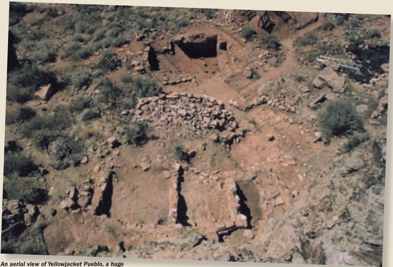
An aerial view of Yellowjacket Pueblo, a huge site in southwest Colorado's Montezuma Valley.

Several of the Conservancy's most significant preserves have been incorporated into state and national parks such as Chaco Culture National Historical Park in New Mexico, Petrified Forest National Park in Arizona, Hopewell Culture National Historical Park in Ohio, and Parkin Archeological State Park in Arkansas. Parkin, in eastern Arkansas, is one of the largest and best-preserved Mississippian culture complexes in the Mississippi Valley, most large sites in the area having been destroyed by looters or by agriculture. The State of Arkansas approved converting the site into a state park in 1967; however, numerous people owned portions of the land it sat on, and the state government failed to provide the necessary funds to purchase their properties, some of which contained homes and other buildings.