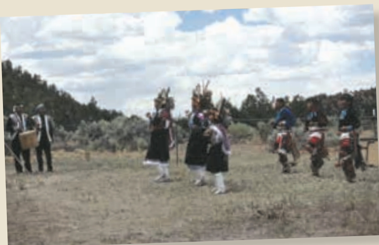
The Zunis celebrate the transfer of the Box S site to their tribe.