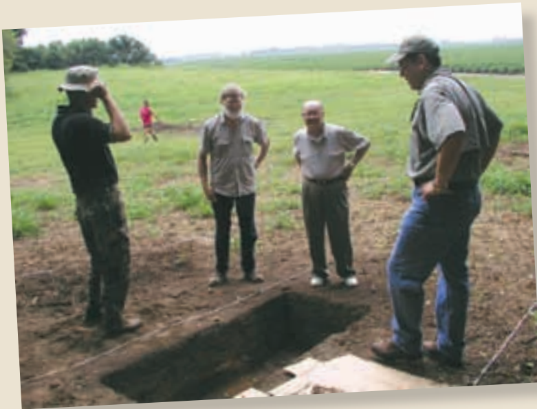
Archaeologists have used remote sensing to guide their excavations at Parchman Place Mounds.

Therefore, acquiring important sites on private property, the Conservancy's mission, remains critical."