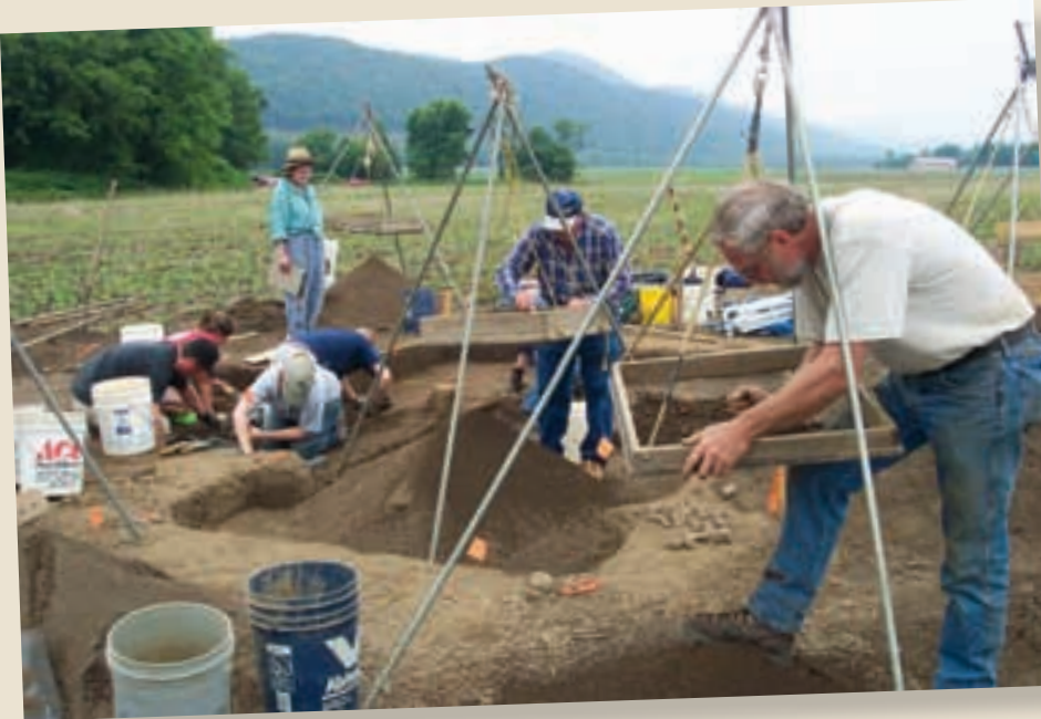
Researchers work at the Barton site.